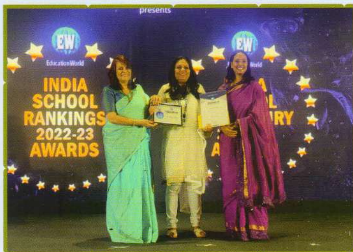
Bal Bhawan School ranked 11th in India, in the Vintage Co-Ed Day School Category (by Education World)