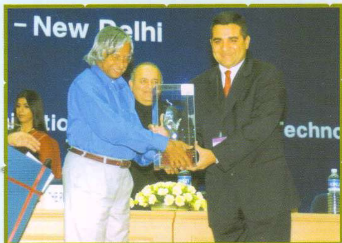
The National I. T. Excellence Award from (Late) Dr. APJ Abdul Kalam The Hon'ble Ex-President of India.