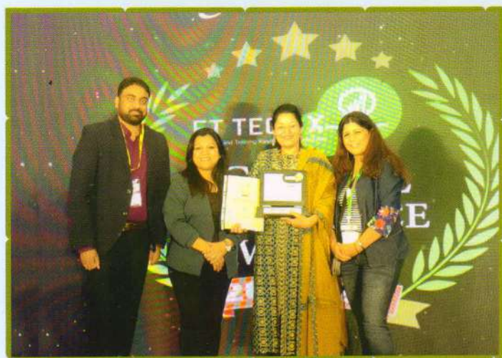
The Best School Excellence Award By Brainfeed School Excellence Awards 2024-25