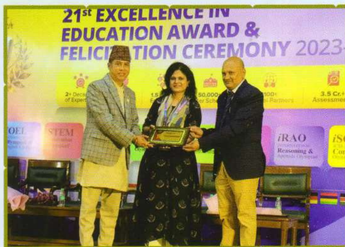
Bal Bhawan School received 'The Institution of The Year' Award By The Silver Zone Olympiad Foundation